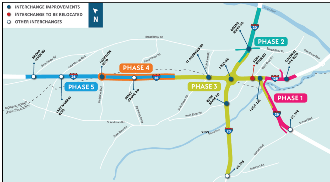
Figure 100-1: Carolina Crossroads Program Phasing Map